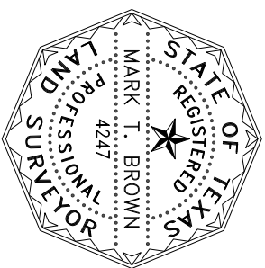
EXHIBIT SHOWING THE LOCATION OF LOTS IN THE WINDMILL ACRES SUBDIVISIONS, ACCORDING TO PLATS THEREOF RECORDED IN CABINET 1, SLIDE 127, AND CABINET 1, SLIDE 58, PLAT RECORDS,

CITY OF ABILENE, TAYLOR COUNTY, TEXAS DRAWING: JUNE 17, 2011